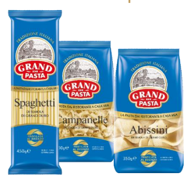
Grand di pasta