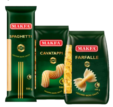
Bronze die pasta

Traditional Italian pasta with authentic taste for restaurant level cooking in your home kitchen.